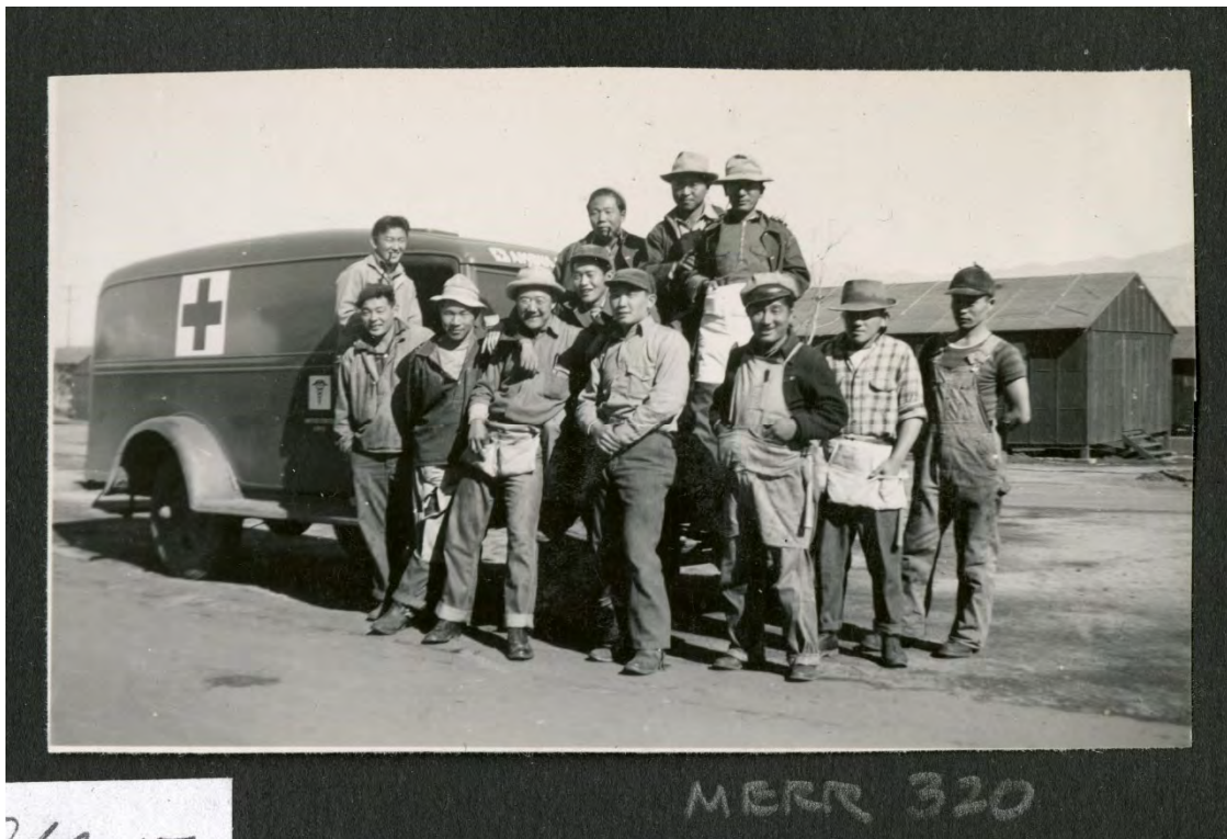
Manzanar ambulance and crew.