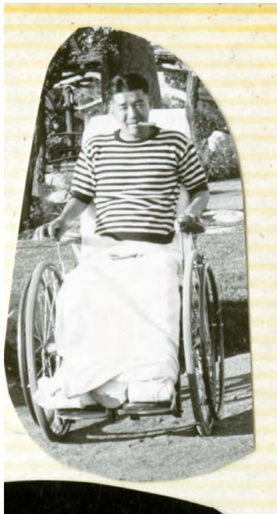
Patient at new hospital.

MM: Well, I did most of it, but then I had to pitch in and do everything else, because with five doctors there’s – we all took turns overnight taking night calls, and so we had to take everything that came along.”