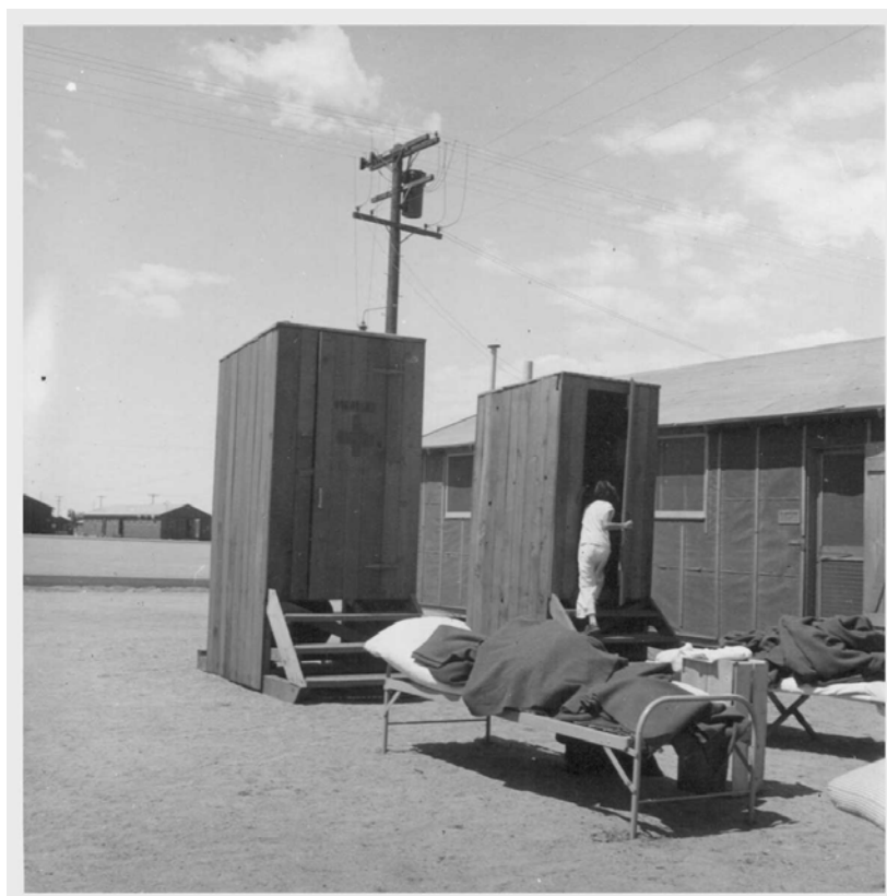
Hospital latrines for patients at Manzanar's first hospital. July 3, 1942.