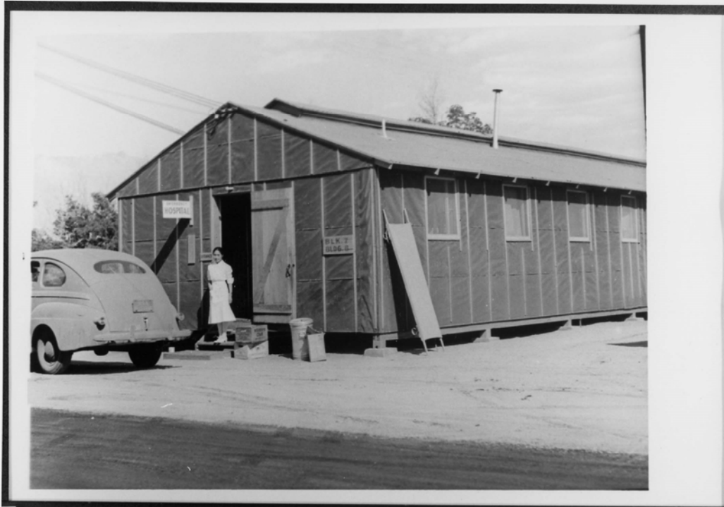
First hospital in Manzanar, Block 7, Building 8. July 2, 1942