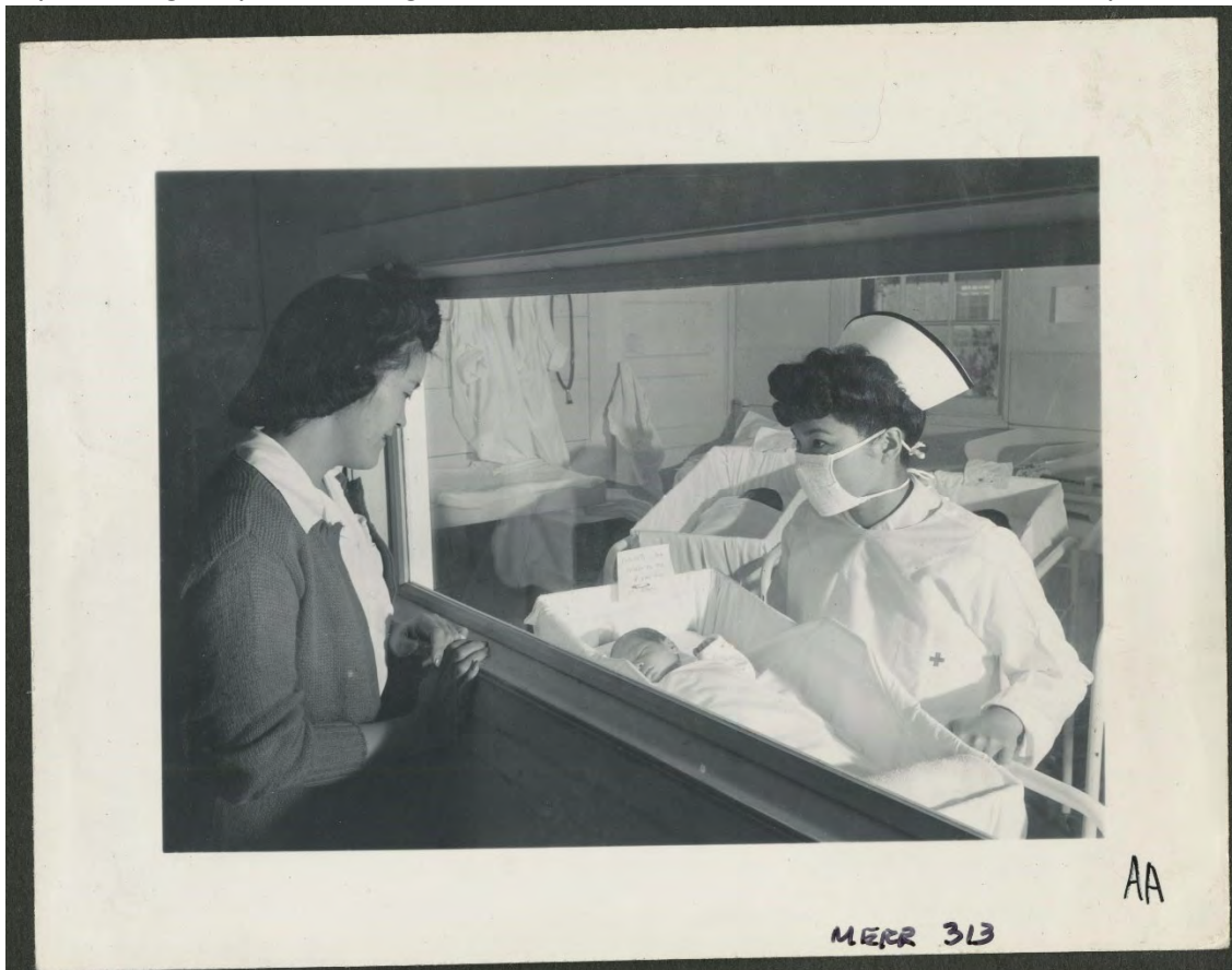
Maternity ward at Manzanar hospital.