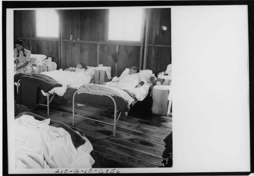
Patients inside Manzanar's first hospital.