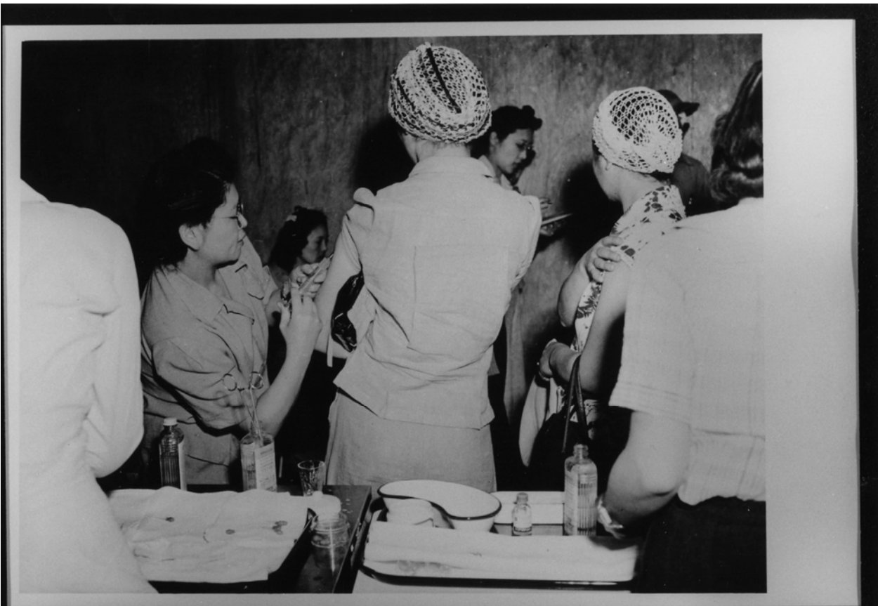
Immunizations at Manzanar, April 2, 1942.