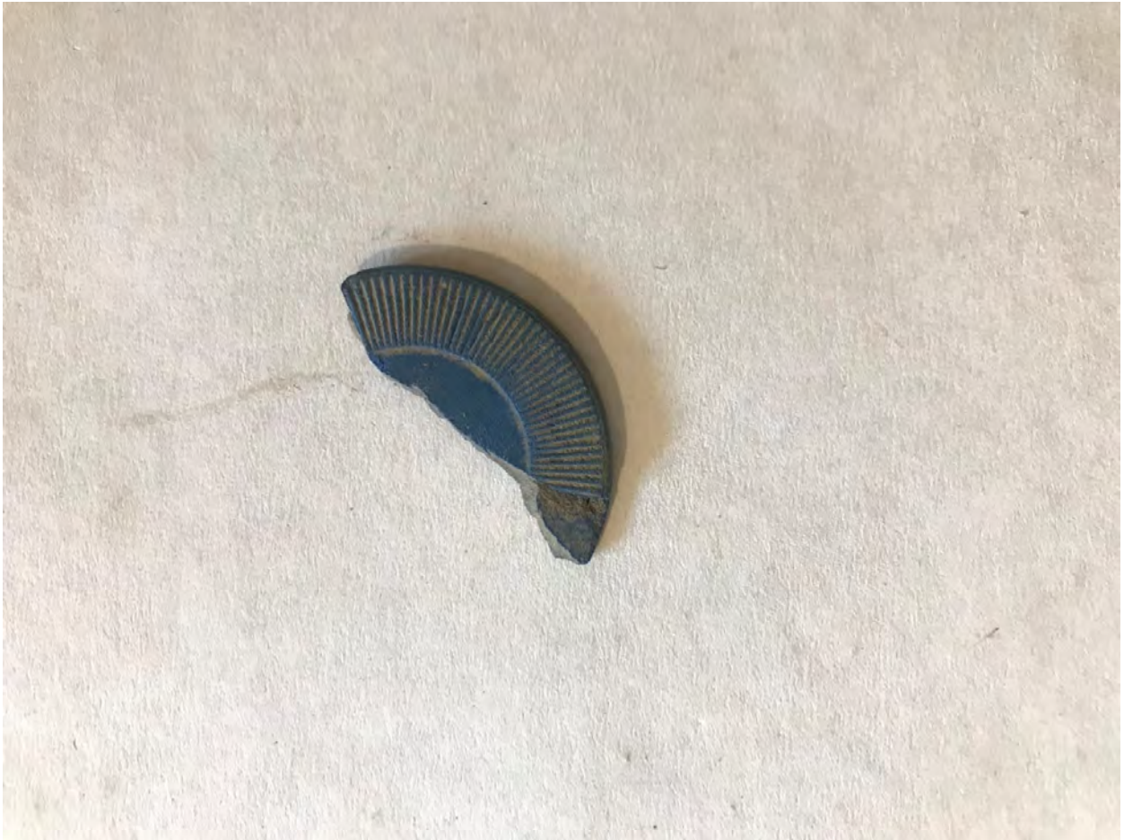
Broken poker chip found in drain at the Manzanar hospital morgue by NPS archeology staff; c2019.