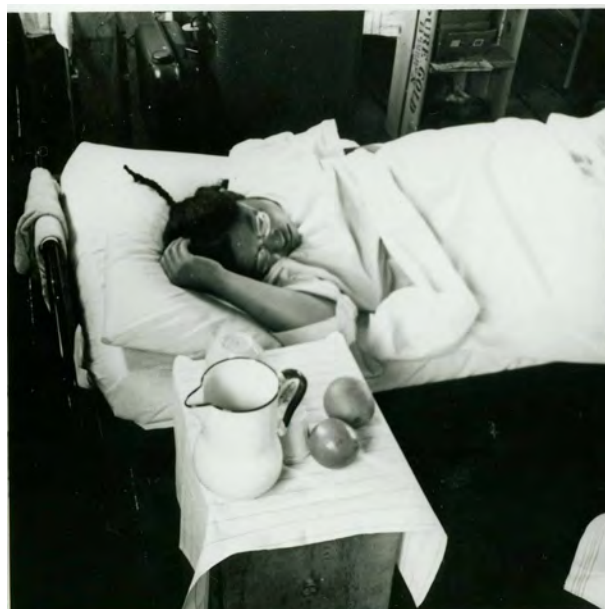
Women's ward in Manzanar's first hospital. Photo by Dorothea Lange, July 3, 1942